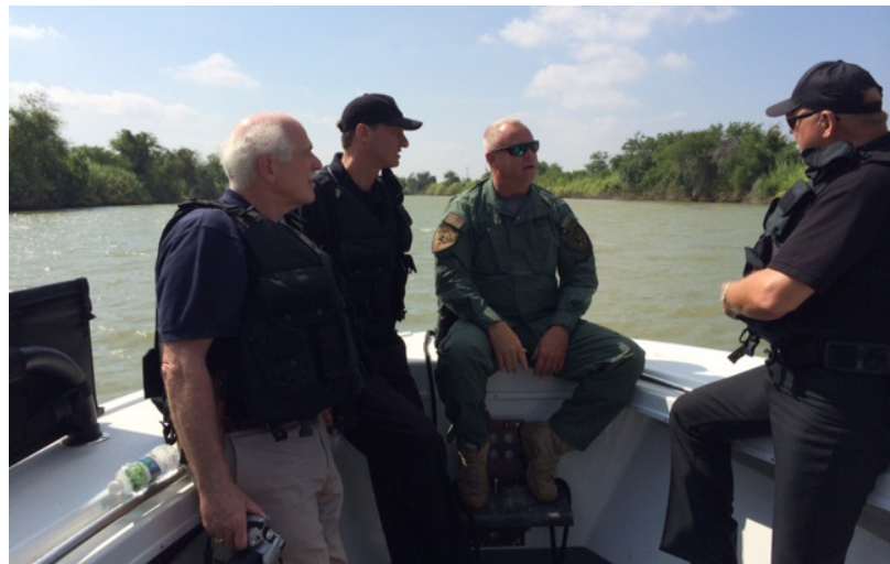
Border Patrol meets with sheriffs during July 2014 ‘fact-finding trip’ organized by FAIR.